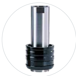
Optional: quick release chuck Ref. 490172