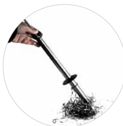
Optional: magnetic chip collector Ref. 490153