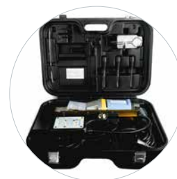
Delivery in carry case