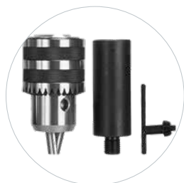
Optional: 16 mm drill chuck & adapter Ref. 490173