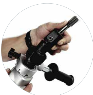
Flexible thread holder