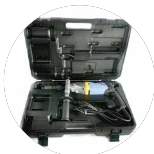
Delivery in a carry case