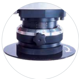
Tool-free adjustable bevel height and scale