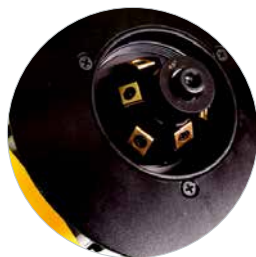
With 45° toolholder