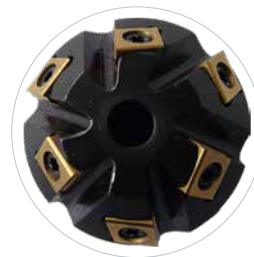
Beveling and deburring starts at 30 mm inner diameter