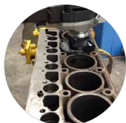
Versatile deburring and chamfering of contours, radii and countersink holes, 30° weld seam and visual edge preparation etc.