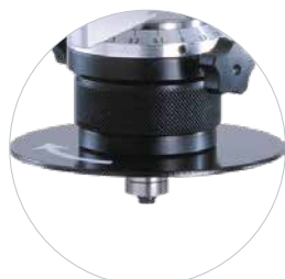
Tool-free adjustable bevel height and scale