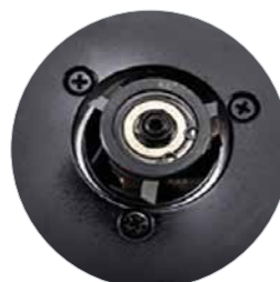
Toolholder with 3 carbide inserts