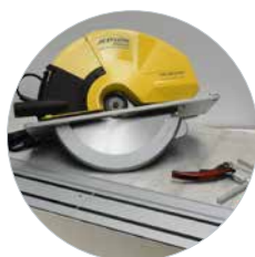
SHDC with guide rail set