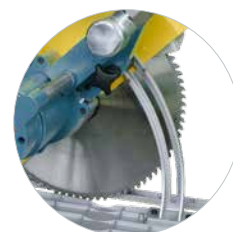
Depth adjustment with scaling