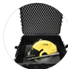
Incl. Professional case with wheels