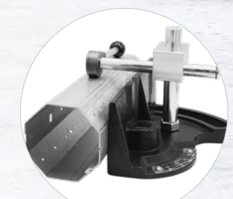
Ideal for sawing roller shutter tubes with the eccentric clamping system Ref. 609910